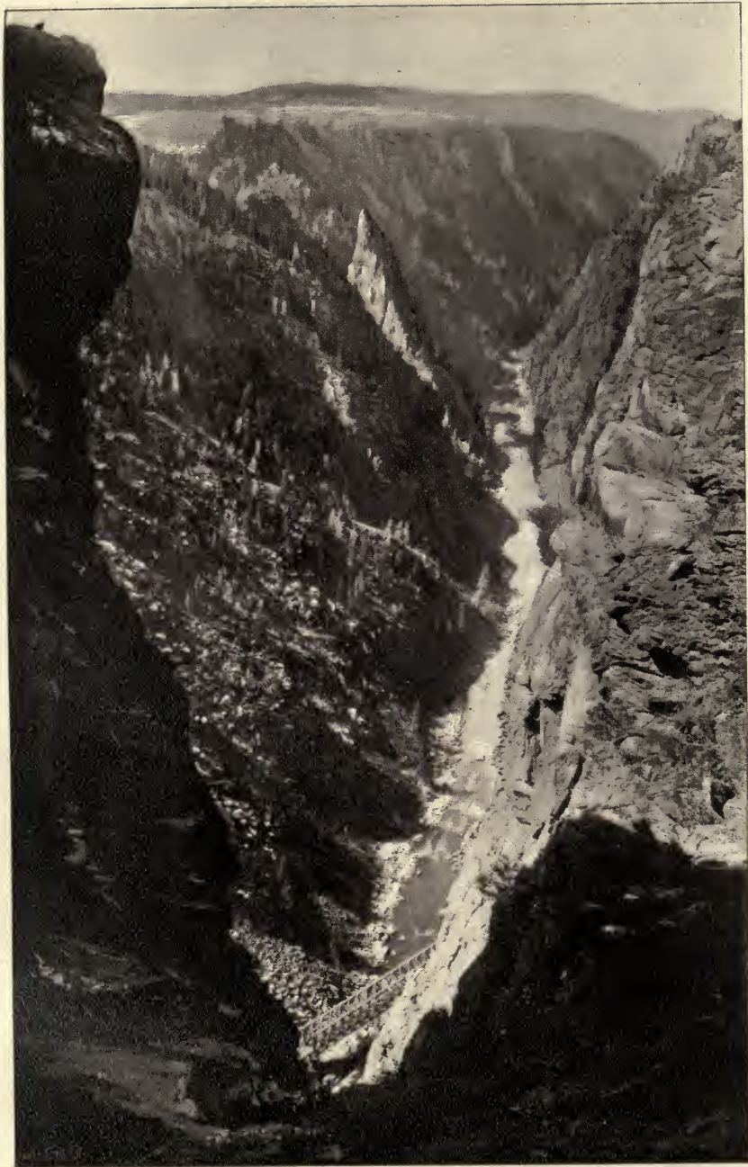
BLACK CANON OF THE GUNNISON. BIRD'S EYE VIEW SHOWING THE CURRECANTI NEEDLE IN DISTANCE